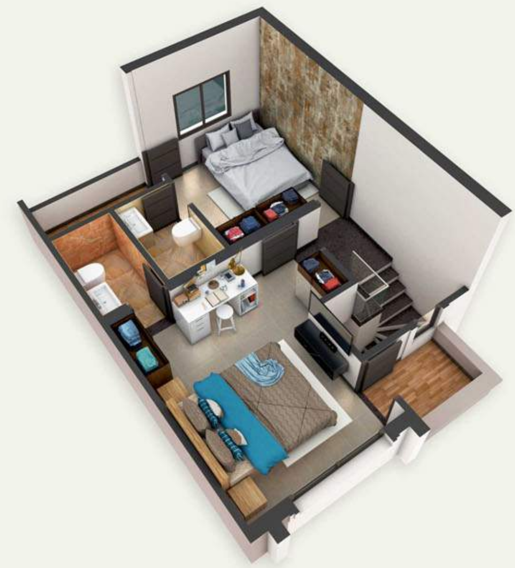
Type - B : Isometric View of First Floor Plan