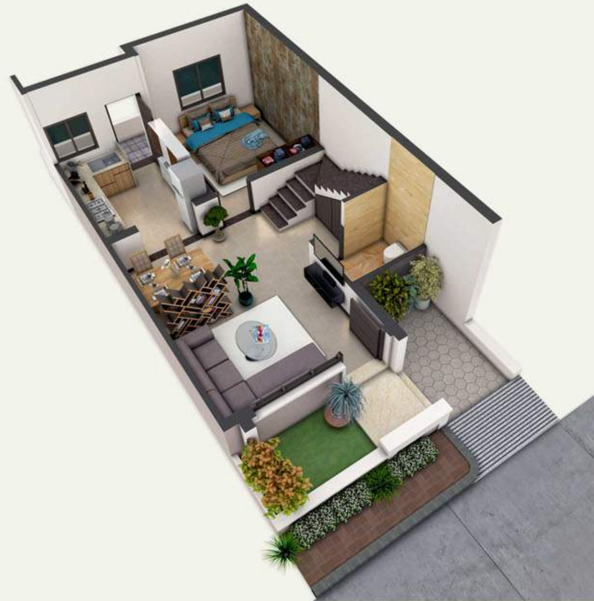
Type - A : Isometric View of Ground Floor Plan