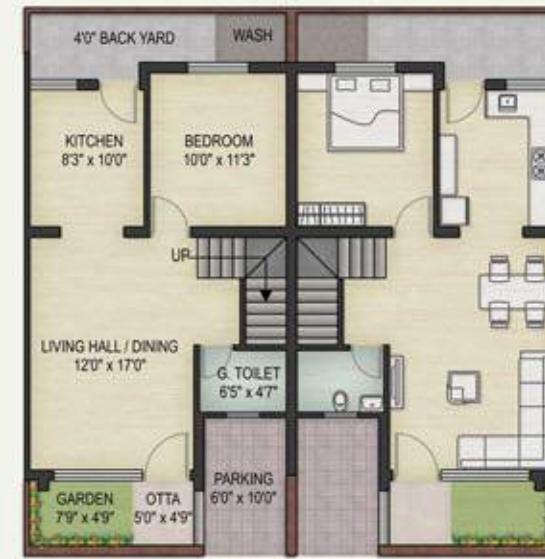
Type - A : Ground Floor - Twin Plan