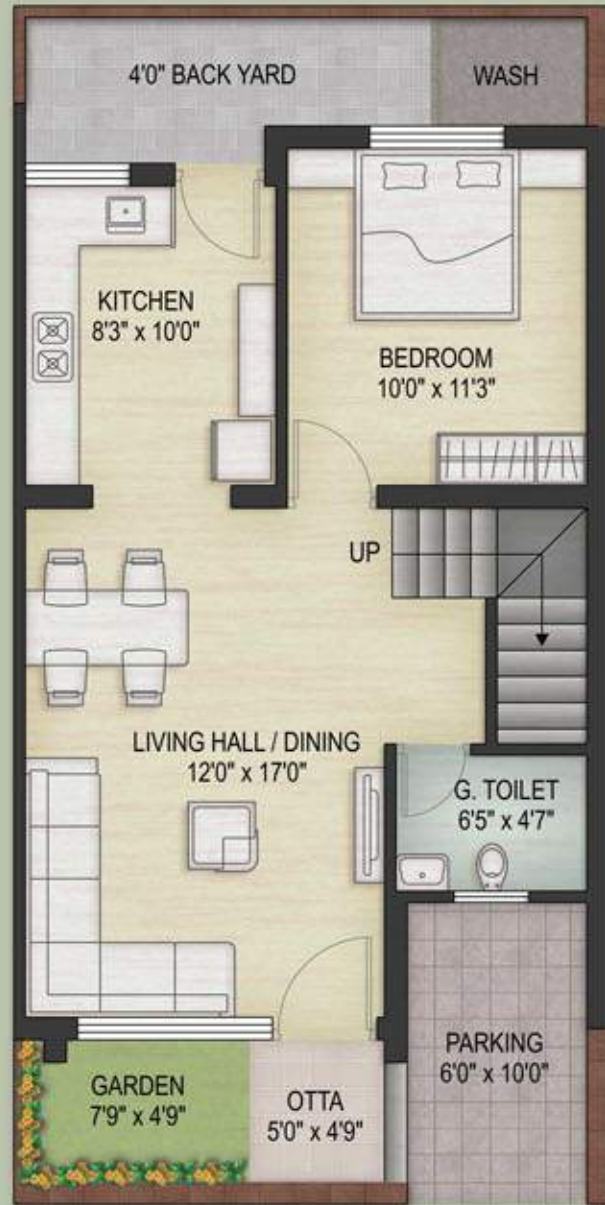
Type - A : Ground Floor Plan