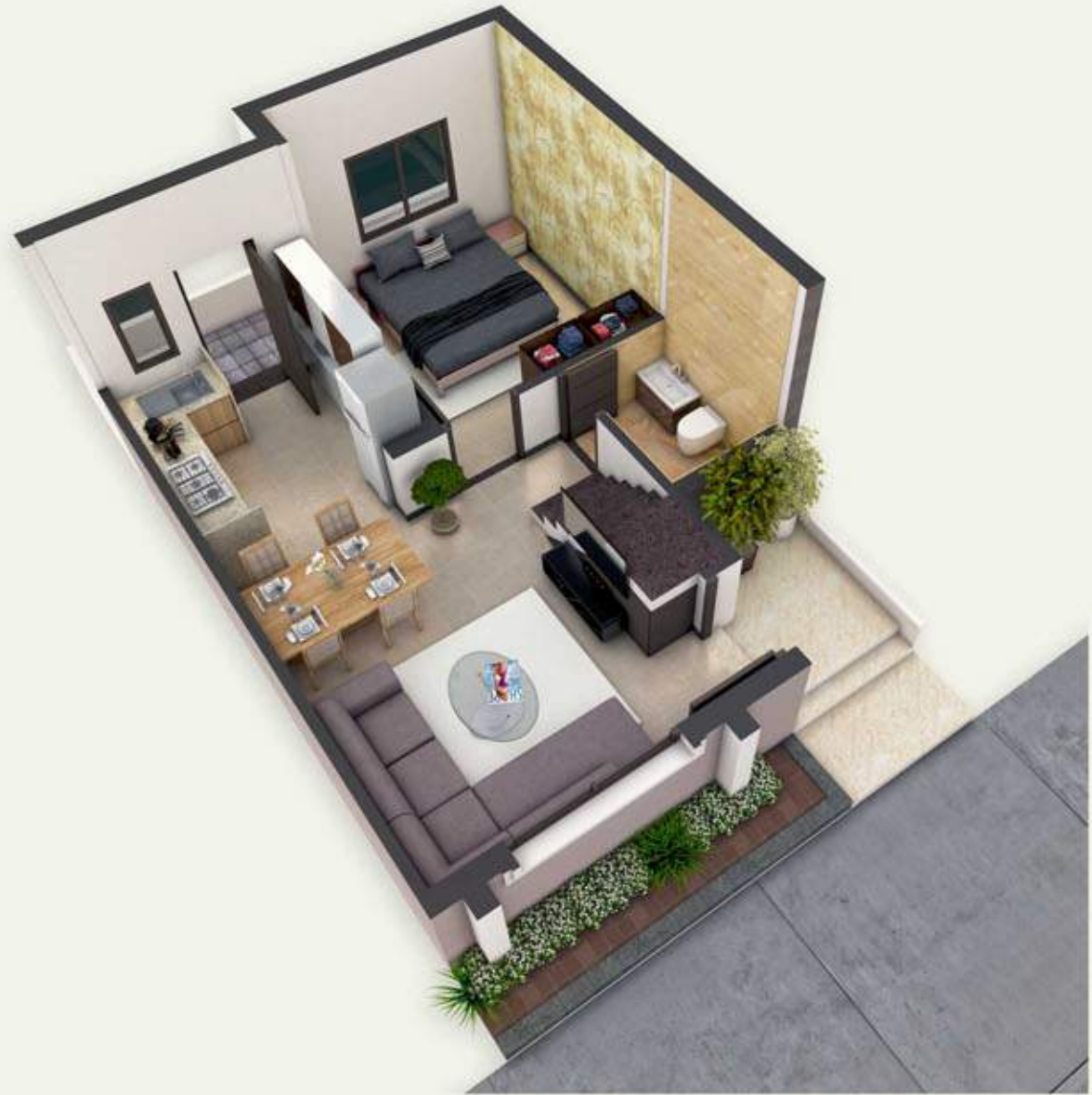
Type - B : Isometric View of Ground Floor Plan