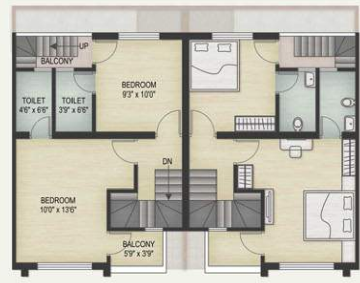
Type - B : First Floor - Twin Plan