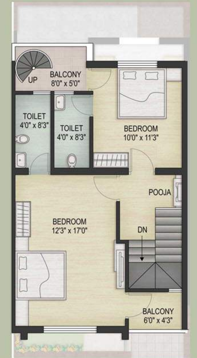
Type - A : First Floor Plan