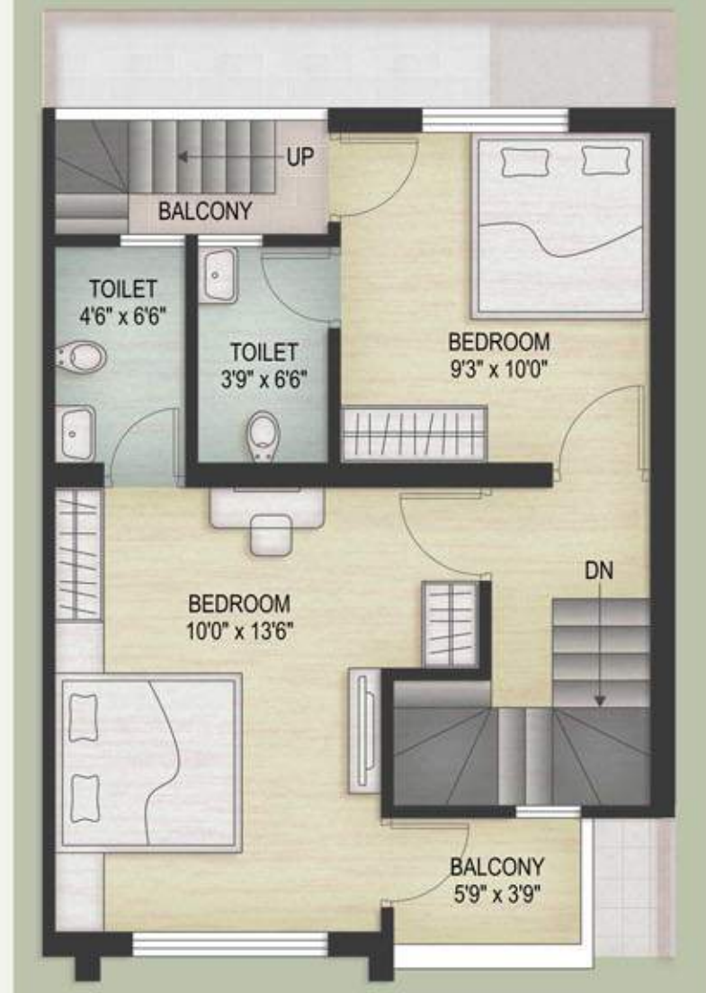
Type - B : First Floor Plan