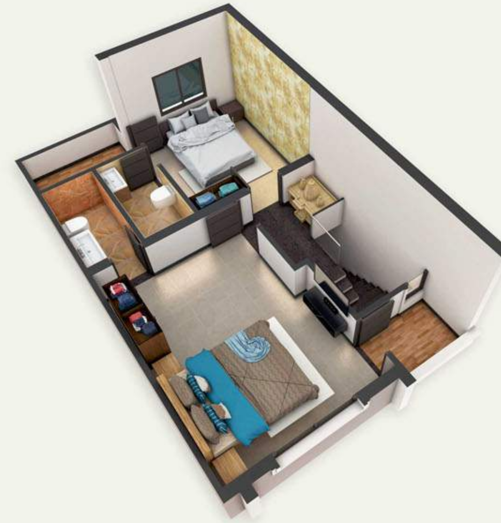
Type - A : Isometric View of First Floor Plan