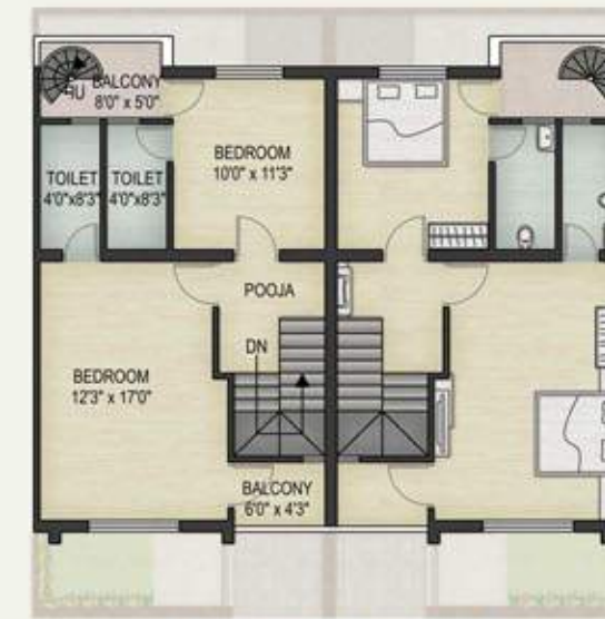
Type - A : First Floor - Twin Plan