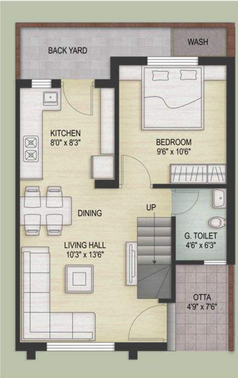
Type - B : Ground Floor Plan