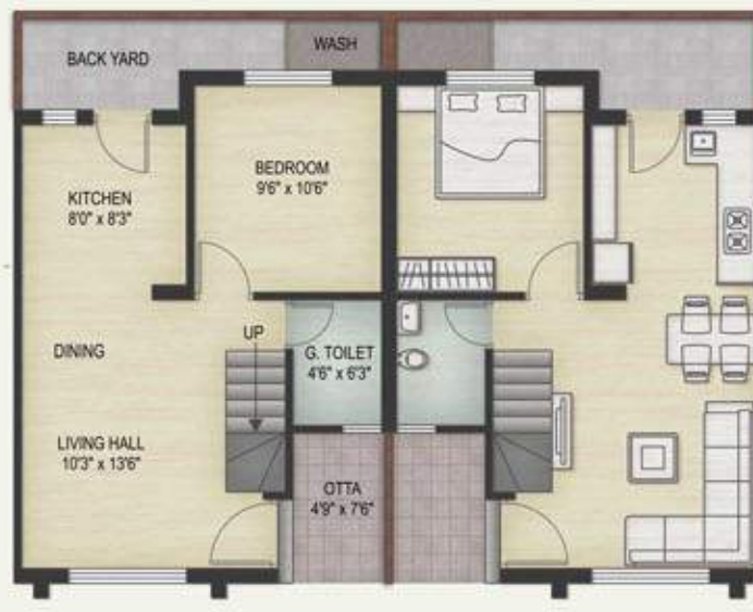
Type - B : Ground Floor - Twin Plan